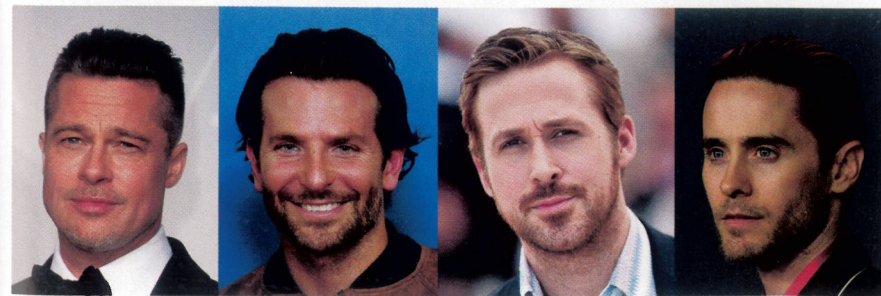
Brad Pitt's bone structure, especially his cheeks and jawline; Bradley Cooper's thick hair; and Ryan Gosling and Jared Leto's noses.